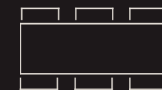
Table and chairs