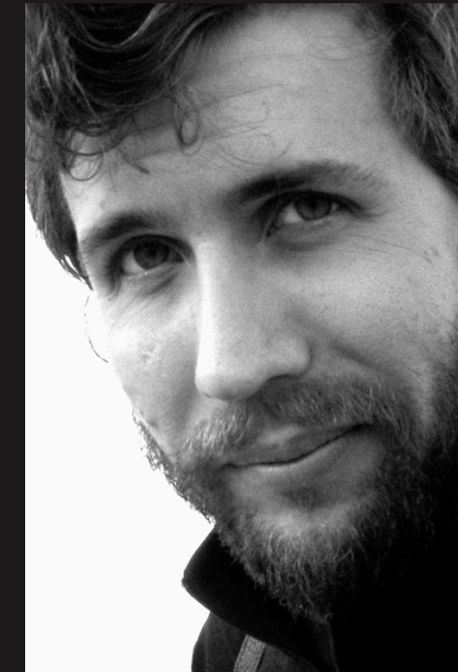
Freddy Komp Production Design Consultation & Construction