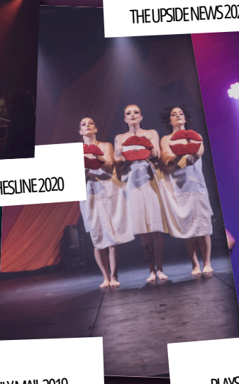
THE CLOTHESLINE 2020