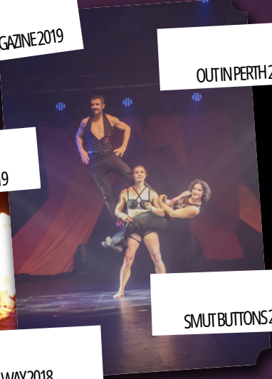
OUT IN PERTH 2019