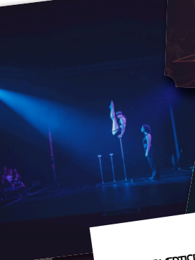
THE ADVERTISER 2020