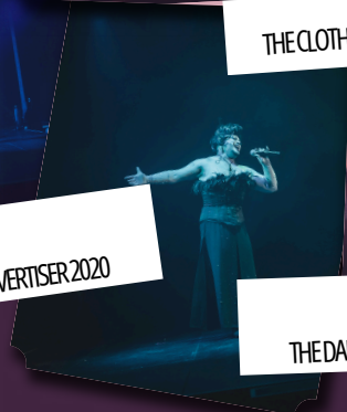
THE DAILY MAIL 2019