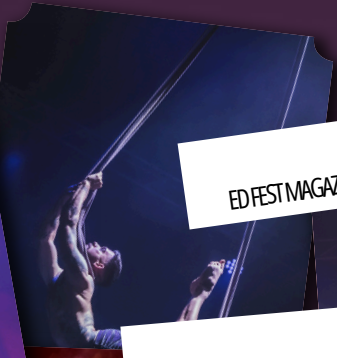
ED FEST MAGAZINE 2019