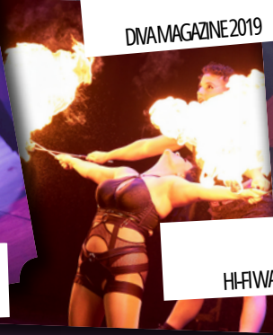
DIVA MAGAZINE 2019