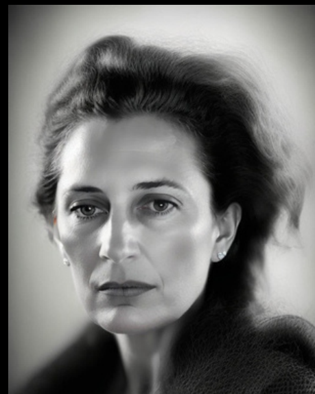
ELVIRA PUCCINI PUCCINI'S WIFE 1860 - 1930