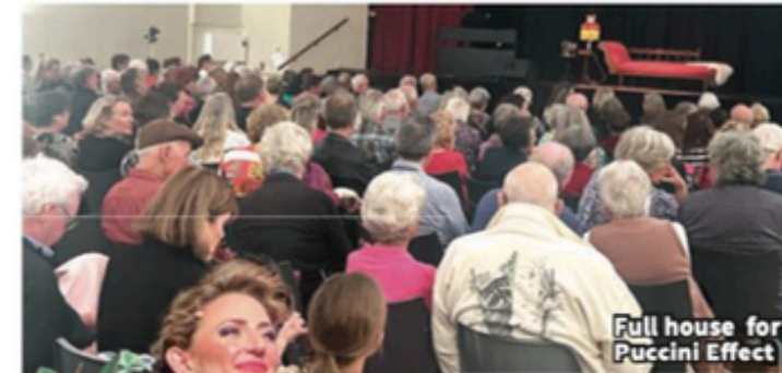
Full house for Puccini Effect