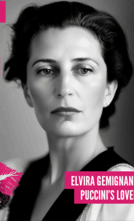
ELVIRA GEMIGNANI, PUCCINI’S LOVER

“PUCCINI WOULD SAY TO ME, ‘SYBIL, TO LOVE, ONE MUST SUFFER.’”