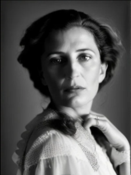
MARIA JERITZA CZECH SOPRANO 1887 - 1982