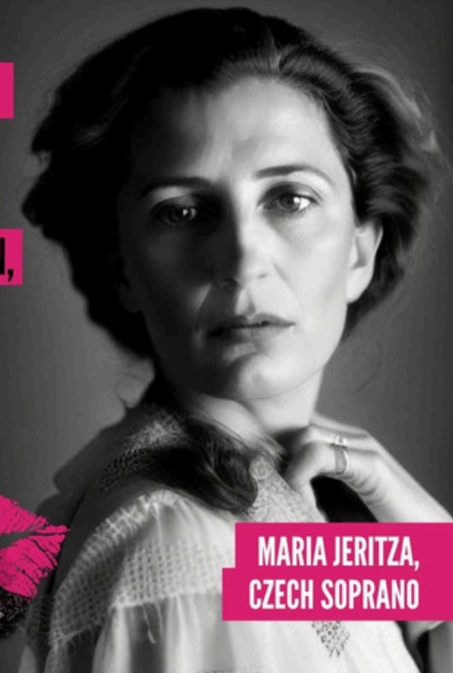
MARIA JERITZA, CZECH SOPRANO

“WHAT COULD I DO? TO PROVE MY INNOCENCE WOULD MEAN BETRAYING MY BELOVED PUCCINI.”